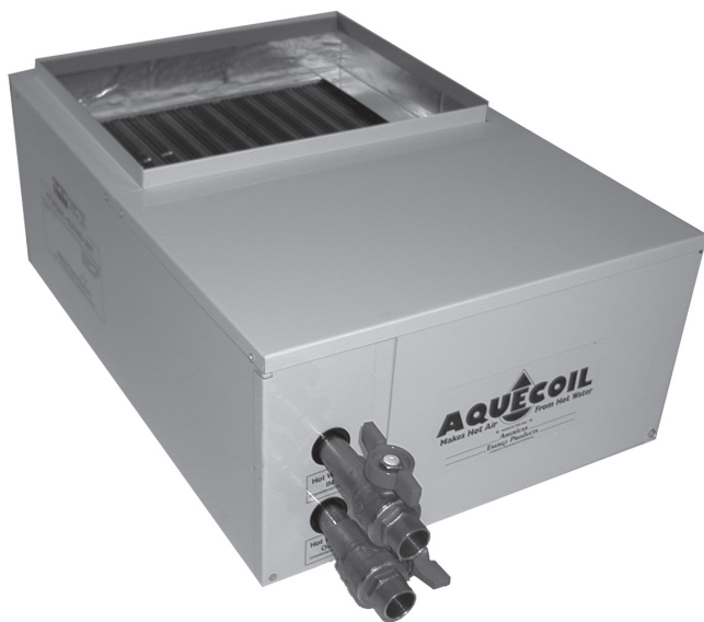
** Shown with optional Valve Kit **