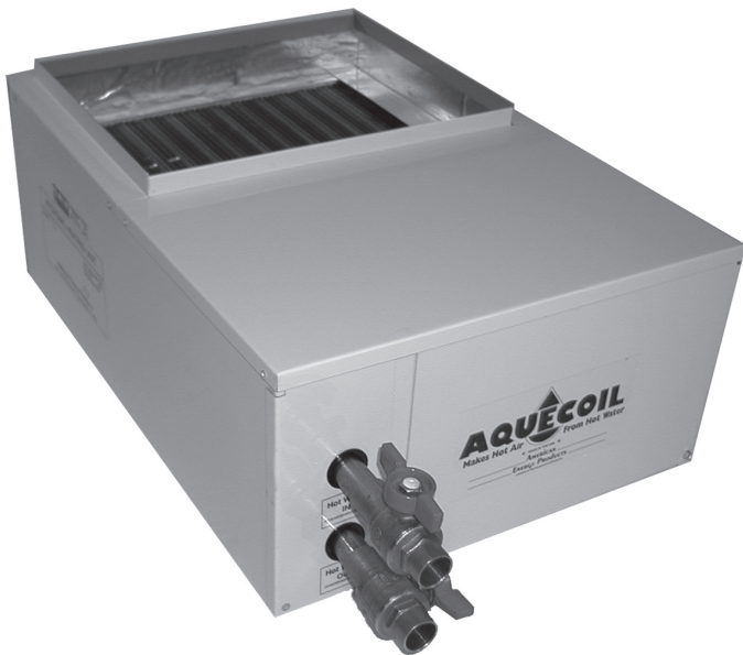
** Shown with optional Valve Kit **