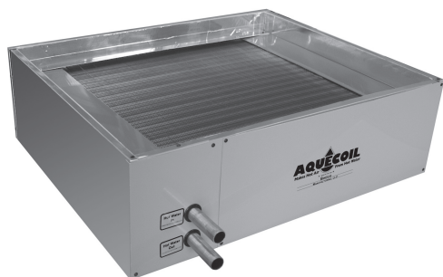
** Shown with optional return side configuration **